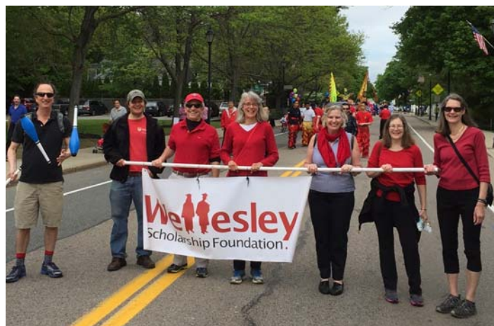
WSF marches in the Wellesley Parade.